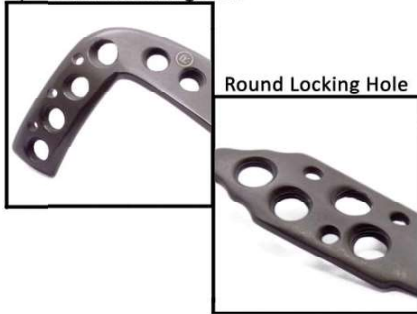
Round Locking Hole